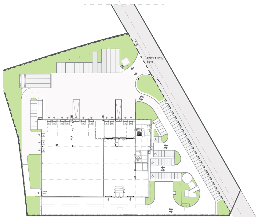
RZESZÓW-JASIONKA AIRPORT AREA